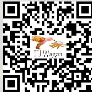
EL WAGON PIZZA