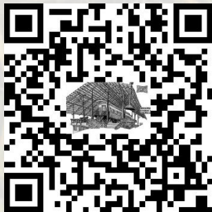
LA CANTINA BBQ