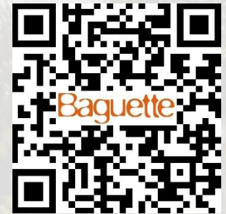
BAGUETTE BAKERY & CAFE