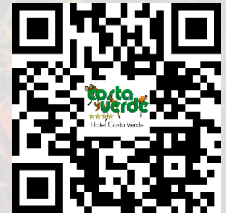
HOTEL COSTA VERDE